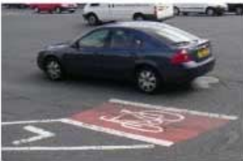
The shortest cycle lane in Leeds?

The city of Leeds is designed around the motor car, with people, buses and bikes fitted in as an afterthought. As result the city is dangerous, noisy, and smelly. If you are not in a car, travelling around in Leeds is difficult. And now there are so many cars that travelling by car is difficult as well! Our approach to planning, high-ways and public transport will put people first, not the car.